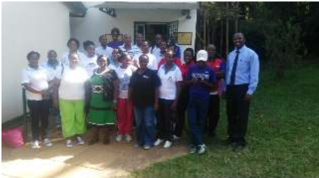
PCEA Ruai West Parish Christian Education Committee retreat

Rights reserved by Presbyterian Church of East Africa. 2018 Production. Printed and Designed by PCEA Jitegemea Press P. O. BOX 27573-00506 NAIROBI, KENYA Tel: 020-6003608, 6008848 Mobile: 0722-205051, 0734-333040 Fax: (+254) 020-6009102 Email: pceajitegemeapress@yahoo.com website: www.pceaheadoffice.org