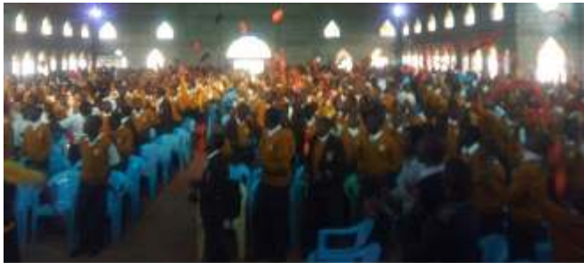
Thika High School Launching 2018 school theme: Moving forward to my destiny