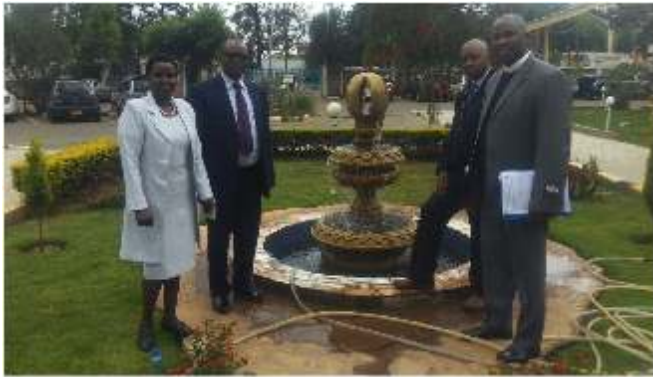
New Director with outgoing Christian Education officials